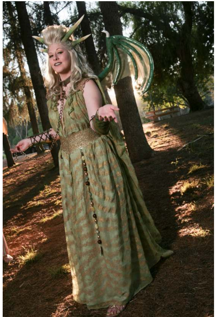
Rhaegal (Inspired by Game of Thrones) Completed in October 2015