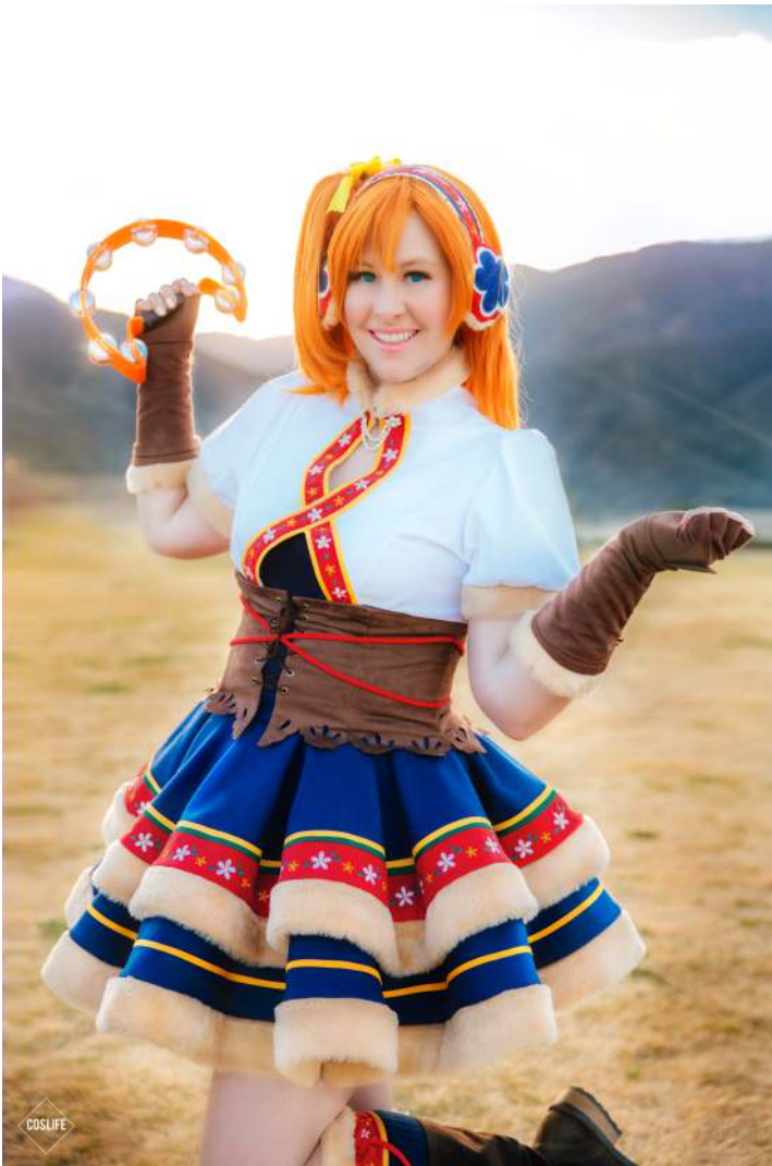
Honoka Kosaka "Snowy Mountain" (Love Live) Completed in January 2016