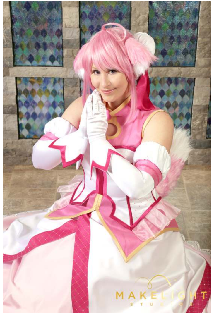
Millhiore F. Biscotti (Dog Days) Completed in July 2015