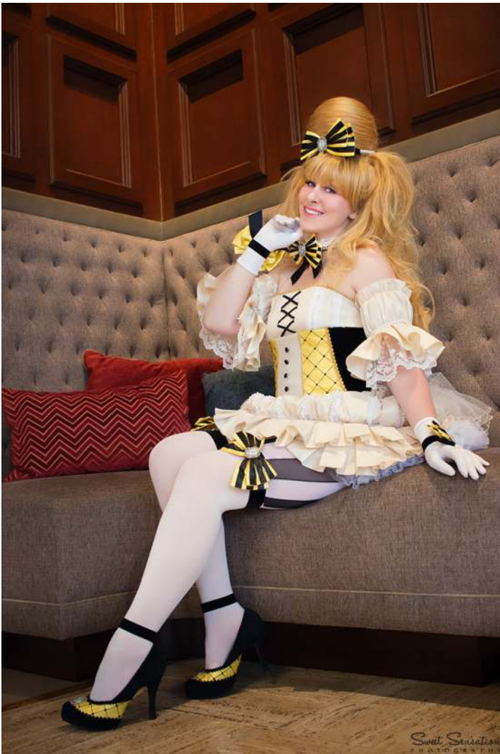
Honey (Sakizo Artworks) Completed in May 2016