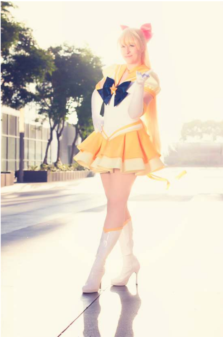
Eternal Sailor Venus (Sailor Moon) Completed in May 2013