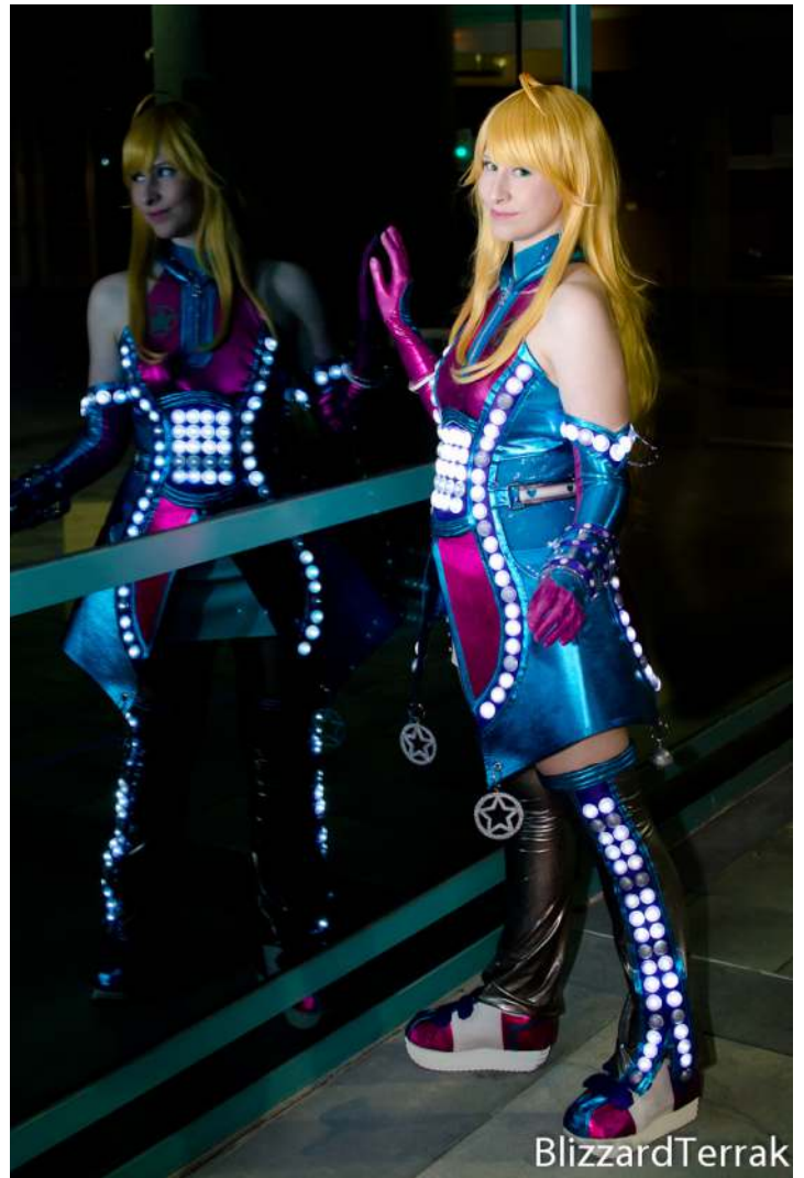
Miki Hoshii "Starry" (The iDOLM@STER) Completed in August 2012