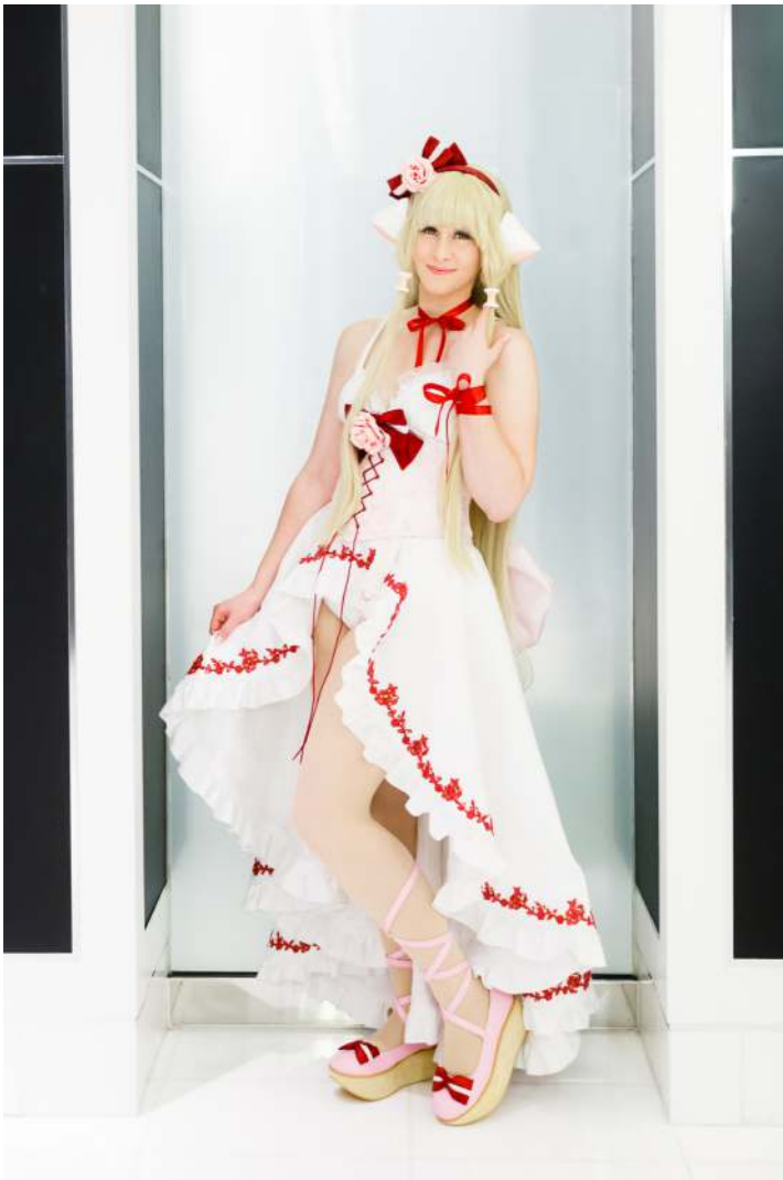
Chii (Chobits) Completed in February 2014